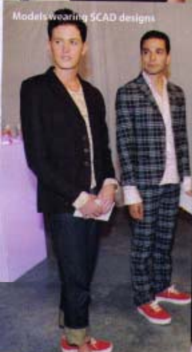
Models wearing 5CAD designs