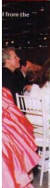
f from the