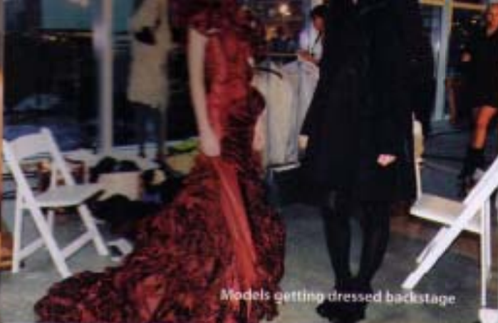
Models getting dressed backstage