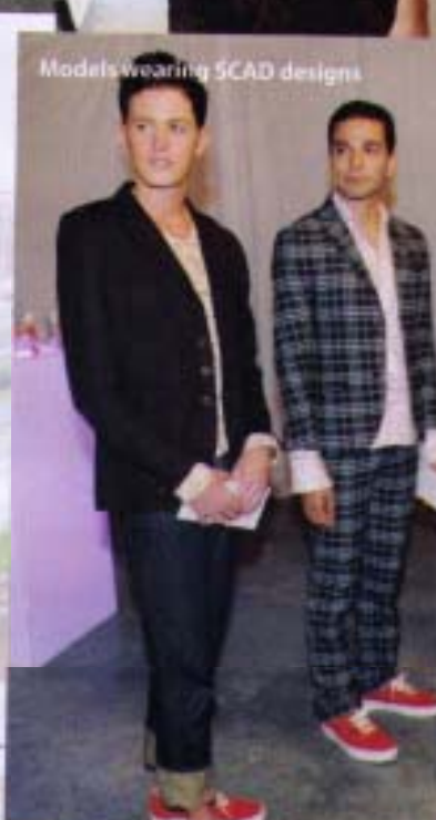
Models wearing 5CAD designs