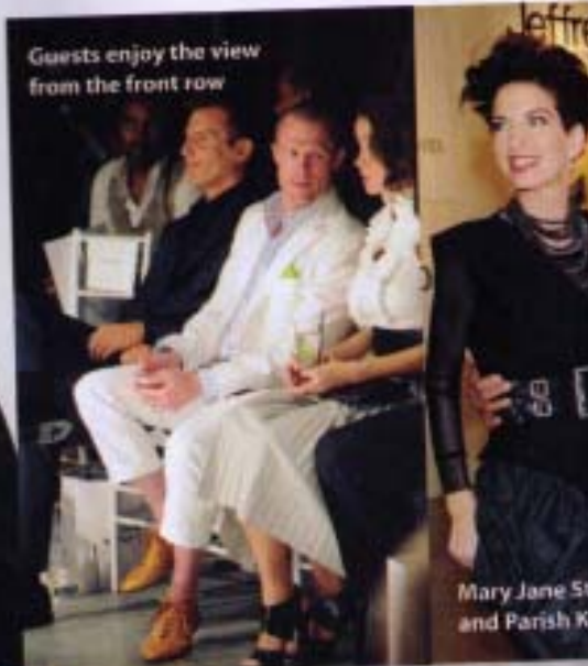
Guests enjoy the view from the front row