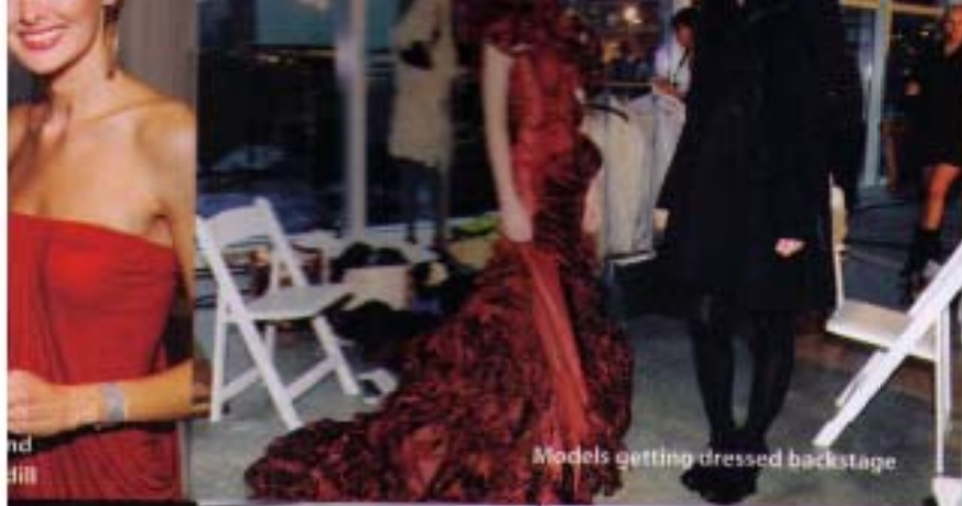
Models getting dressed backstage